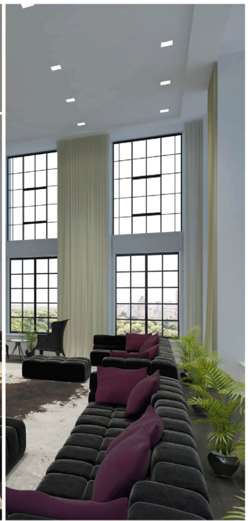
5000K, Dimmed to 75%

The idea interested USAI because they had never used light so blue in interior settings, and the designers explained that studies showed that students fared better on math exams in classrooms with blue light. This prompted more research into the lighting used not only in education settings, but offices and residential areas as well. It was discovered that in order to reset the body's circadian rhythms each morning, we need light that registers between 5,000 and 6,000K (Kelvin temperature), which is a blue light that mimics daylight. With that light in the morning, the body is fully awake, and as the day goes on or becomes more casual, the light should become warmer and closer to 2,700K.