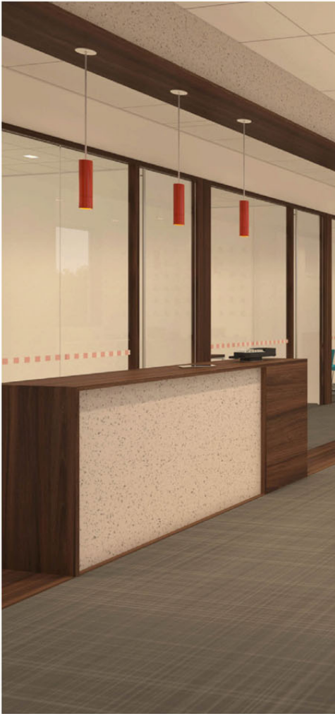
3200K, Dimmed to 80%