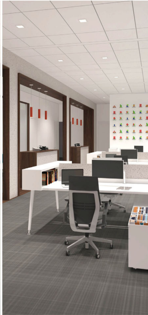
4000K, Dimmed to 90%