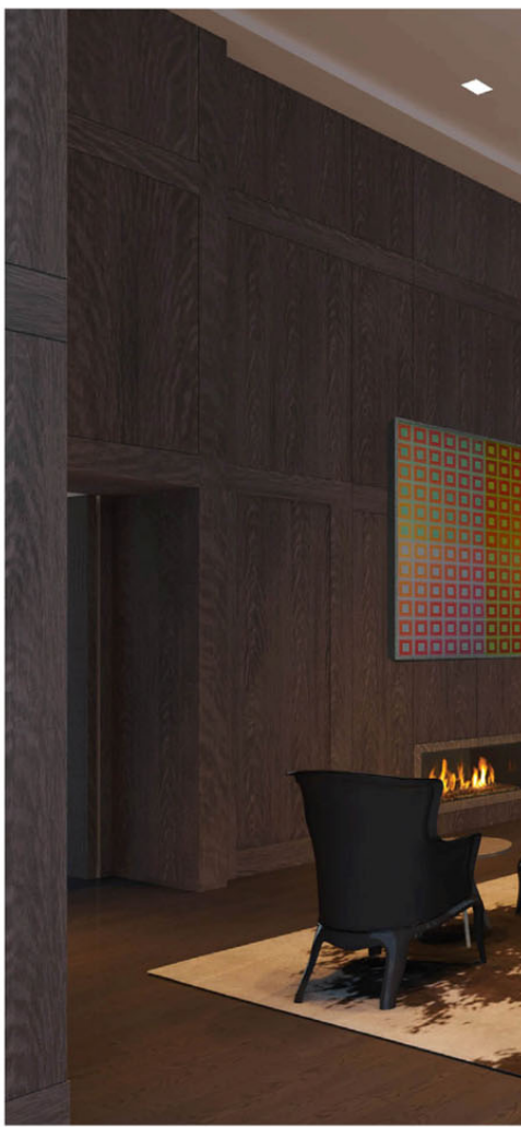
2200K, Dimmed to 50%