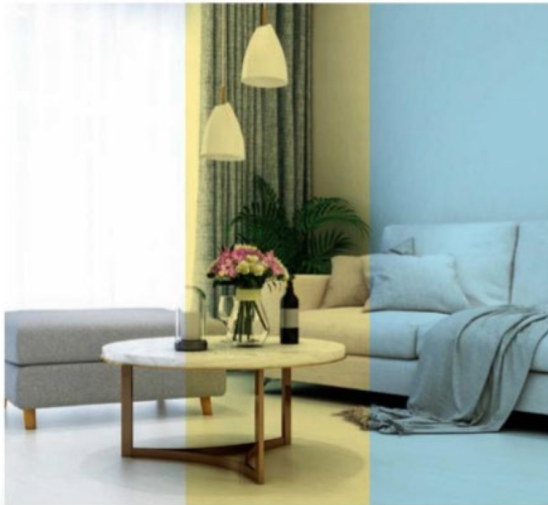
all aflow ↗