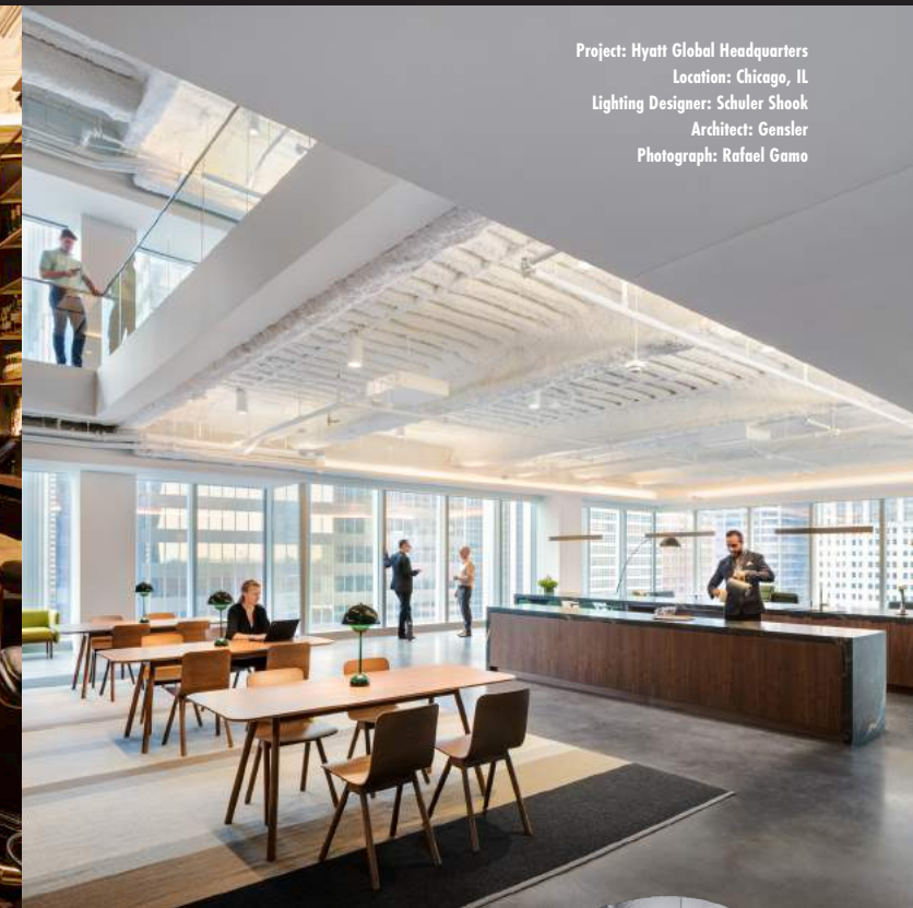
Project: Hyatt Global Headquarters Location: Chicago, IL Lighting Designer: Schuler Shook Architect: Gensler