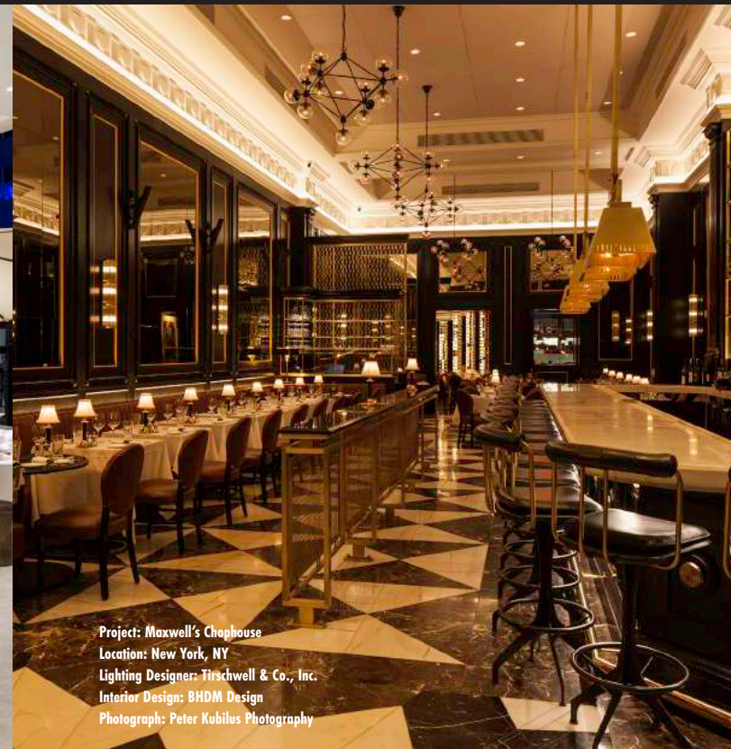
Project: Maxwell's Chophouse Location: New York, NY Lighting Designer: Tirschwell & Co., Inc. Interior Design: BHDM Design