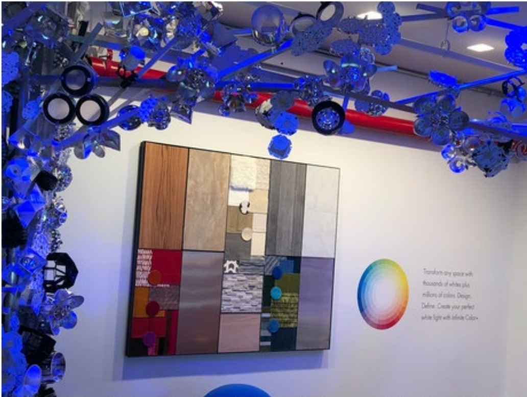
A wall collage display of various textures, fabrics and colors is available at the Collaboratory for demos showing how differently tuned LEDs affect color perception

USAI's Barrett brought the tutorial full circle when he encouraged integrators to be as mindful, when working out lighting plans, as interior designers are about the architectural elements and artwork and sculptures that will occupy the space that they are designing the technology for. "It only raises the value you bring to your clients," he said.