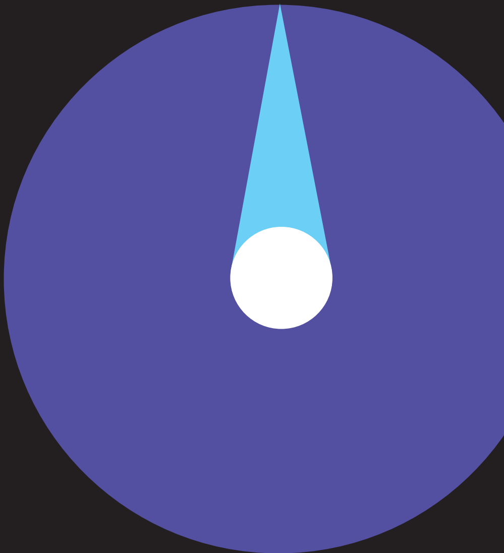
Ultra Narrow 7°